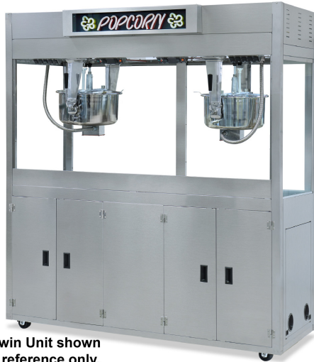
General Twin Unit shown for image reference only.